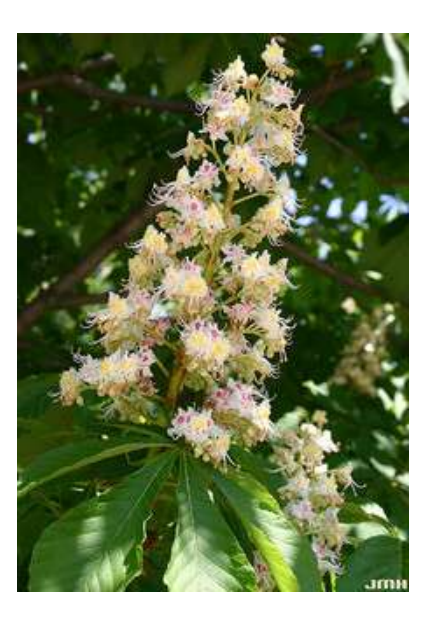
Figure 1 Horsechestnut