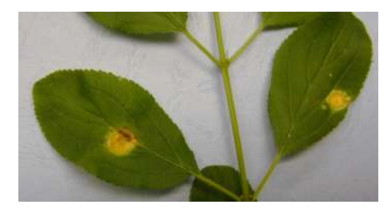
Figure 12 Rust on buckthorn

by the Illinois Exotic Weed Act a few years ago. The act states that "it shall be unlawful for any person . . . to buy, sell, offer for sale, distribute or plant . . . exotic weeds without a permit issued by the Department of Natural Resources". So we can be happy to see that this plant is diseased. The down side is that rust is not fatal.