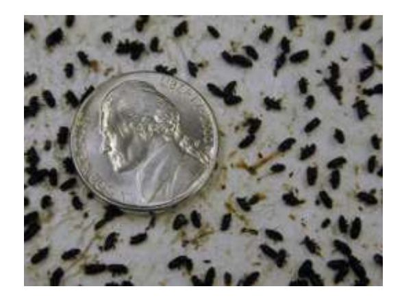
Figure 7 Elm bark beetles

in our pheromone trap this week. These are the insects that spread the fungus that causes Dutch elm disease (DED). The beetles (figure 7) are dark brown and about 1/8 inch long (smaller than a grain of rice). Everyone who sees them is amazed at their small size considering how much damage occurs from them visiting trees and spreading the fungus. The adults lay eggs in dead or dying elm trees that still have bark attached. Larvae feed under the bark of the dead or dying elm. When they emerge as adults from infected trees, the spores of the DED fungus stick to their backs. The beetles fly to the tops of healthy elms to feed. The beetles are especially attracted to fresh wounds from pruning, storm damage or bark damage. Trees are most susceptible to infection during mid-spring to early summer when they are actively growing. The