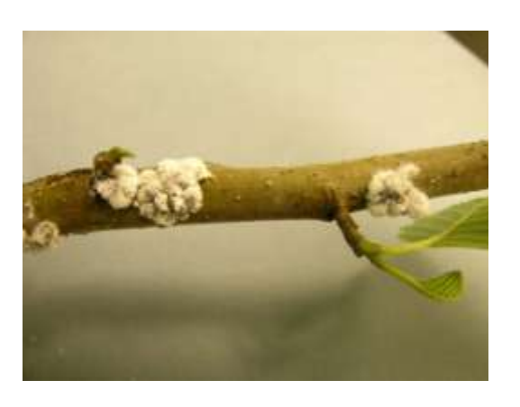
Figure 4 Wooly alder aphids

Woolly alder aphids ( Paraprociphilus tessellates ) have been found on alders on The Morton Arboretum grounds this week. Aphids are small (about 1/12<sup>th</sup> of an inch long) and have sucking mouthparts, long, thin legs, long antennae, pear-shaped body, and a pair of tube-like structures (called cornicles) emerging from their abdomen. Two hosts are needed to complete their life cycle: alders and silver maples. The eggs are usually laid in fall in the bark of the maples. When the young hatch in spring, they collect on leaves and reproduce. Their offspring fly to alders and collect on the twigs where new generations develop. They are small and covered with white waxy filaments, which makes them easy to see