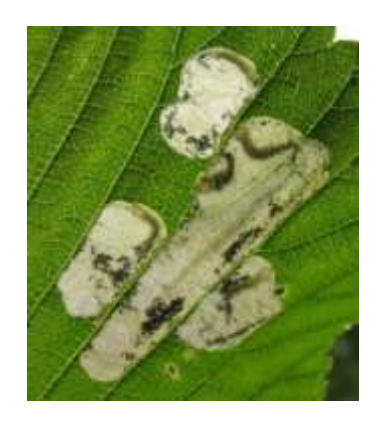
Figure 9 Leafminer damage

http://www.ext.colostate.edu/pubs/insect/05548.html