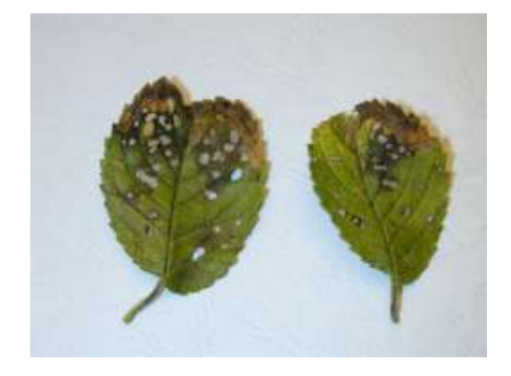
Figure 10 Damage from European elm flea weevil

Adult feeding results in tiny shot holes (figure 10) in the leaves, and heavy feeding can cause newly expanding leaves to wither and turn brown. After feeding, the female weevil cuts a cavity into the leaf mid-vein and inserts an egg. The hatching larvae create blotch mines at the leaf tips. Larvae feed for about 2-3 weeks, and then pupate within the mined leaf. The significant feeding can reduce photosynthetic capacity of the tree, thereby impacting overall tree vitality.