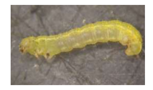
Figure 6 cankerworm

The fall cankerworm caterpillar eggs are laid in late fall and winter. The spring cankerworm caterpillar eggs are laid in early spring. Both cankerworm eggs hatch at their host's budbreak. Full-grown cankerworms are about 2.54