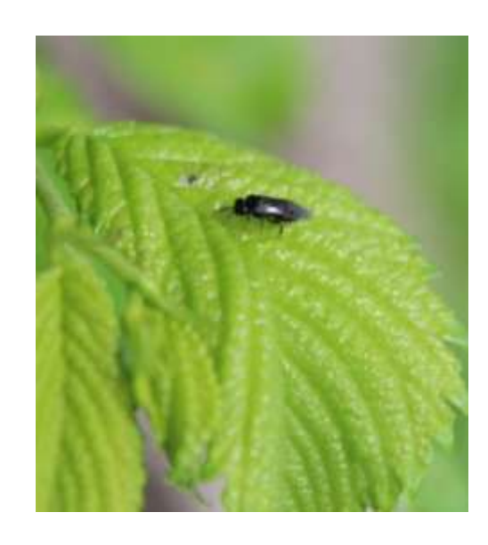
Figure 8 Adult leafminer laying eggs

Elm leafminer ( Fenusa ulmi ) adults are laying eggs on elms leaves this week (figure 8). The adults emerge in spring to lay eggs in elm leaf tissues. After about a week, the eggs hatch and young larvae begin to make mines in the leaves (figure 9). The sawfly larvae will feed on the leaf tissue between the upper and lower epidermis of the leaves. The mines at first look like U-shaped brown spots between veins in the leaf. Eventually the insects will eat a hole through the leaf epidermis, fall to the ground, and excavate a hole in the soil to overwinter. Severe damage can result in defoliation. To test a leaf for miners, hold the leaf up to the light. If the insect is still in the leaf, you can see it. You will also be able to see frass (insect feces) which looks like pencil shavings within the mined area. They spend most of their life cycle burrowed about an inch in the ground.