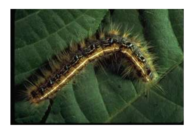
Figure 5 Eastern tent caterpillar

Eastern tent caterpillars prefer trees in the rose family, such as wild black cherry, apple and crabapple, plum, and peach, but occasionally will feed on ash, birch, willow, maple, oak, and poplar.