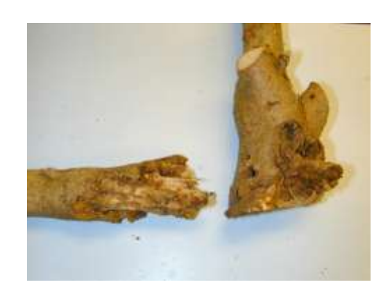
Figure 2 Damage caused by viburnum crown borer

The viburnum crown borer moths have emerged. Our scouts have reported a few adults caught on our pheromone trap. Viburnum borers (Synanthedon sp.) are clearwing moths that lay eggs on the bark or in wounds of viburnums near the soil line. The larvae hatch and tunnel into the cambium from several inches below the soil line to about 18 inches above. Larvae are white and legless with brown heads and eventually grow to ¾ in long. Damage looks like gnarled and scarred stems, and eventually there is dieback of stems and the whole plant may die (figure 2). The insects overwinter as larvae and pupate in spring. The moths usually emerge from infested viburnums in June to lay eggs near wound sites on other viburnums.